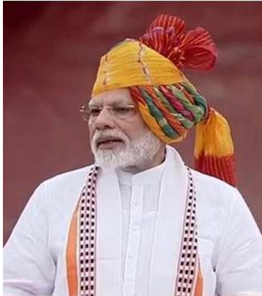
Shri Narendra Modi Prime Minister of India

“ .... I declare from the Red Fort today that in the days to come, we will take forward the Jal Jeevan Mission. The Central and the State governments will jointly work on this Jal Jeevan Mission . We have promised to spend more than Rs. 3.50 Lakh Crores on this mission in the coming years.....in the next five years, we have to do more than four times the work that has been done in the last 70 years...”