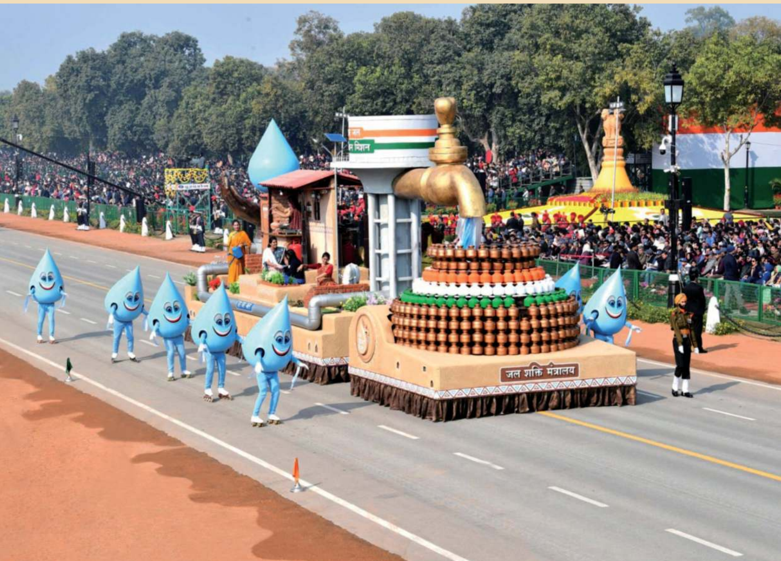
Best Tableaux Republic Day Parade 2020 on Jal Jeevan Mission