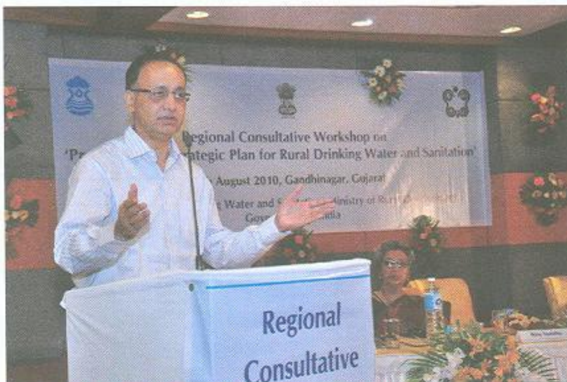
Shri Arun Misra, Secretary, Department of Drinking Water and Sanitation

The Department drew up an Action Plan to prepare the Strategic Plan with the intention of laying down a medium-term perspective plan for rural water supply and rural sanitation sector. The idea was to prepare a plan that would guide the Department in the rural drinking water and rural sanitation sector in the two years of the current plan, the 12th and 13th Plan periods i.e. next 12 years upto 2022. This would enable the Department to work towards an aspirational goal for the sector in the rural areas.